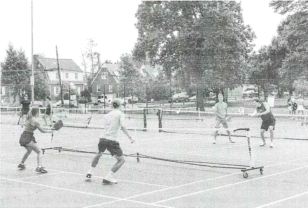
Pickleball at the Walter Reed Community Center is played on repurposed tennis courts.

"I thought maybe I could live with it, maybe it would fade into the background," she said of the clamor, which began around the height of the coronavirus pandemic and now reverberates through her home, even when her windows are closed. "But it never did."